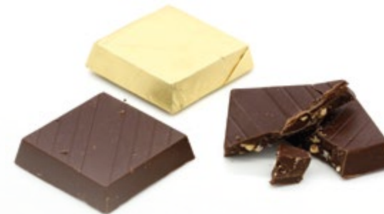
LE CARRÉ PRALINÉ Praline chocolate with roasted hazelnut