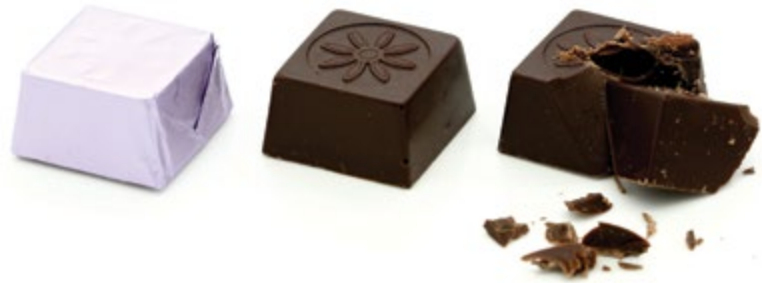
LE CROQUE PISTACHE Crispy pistachios filled dark chocolate