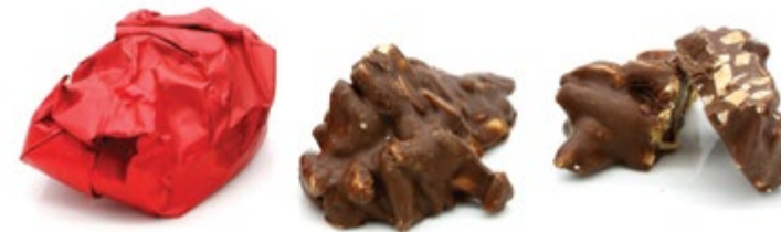
LE ROCHER Roasted almonds coated by milk or dark chocolate