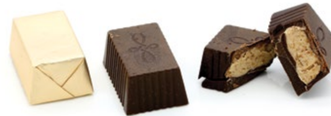
LE FONDANT CARAMEL Salty caramel filled dark chocolate