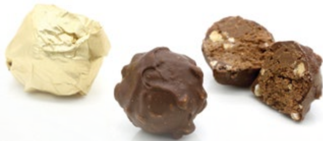
LE CROUSTILLANT AU LAIT Crispy ganache coated by milk chocolate