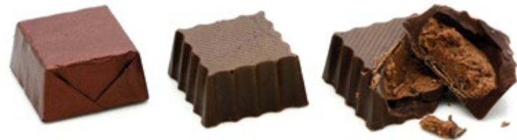
LE TOUT CHOCOLAT Crunchy chocolate filled milk chocolate

Our signature Belgian chocolate selection is renowned to pamper taste buds. Select your preferred pieces at $80 per Kg