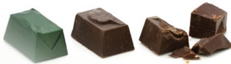
L'AFTER EIGHT Mint flavored dark chocolate