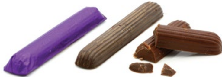
LA SAVEUR DE PROVENCE Dark chocolate with a taste of lavender