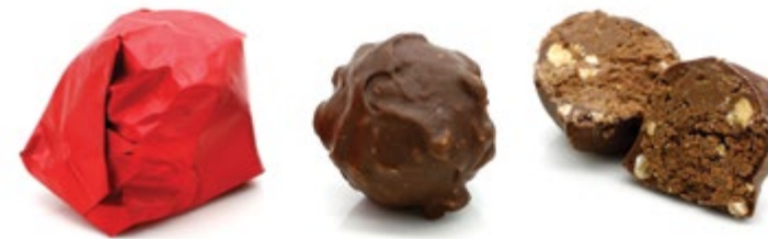
LE CROUSTILLANT AMER Roasted almonds coated by dark chocolate