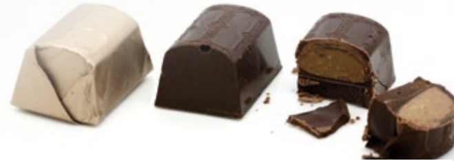
LE COLOMBIEN Coffee filled dark chocolate