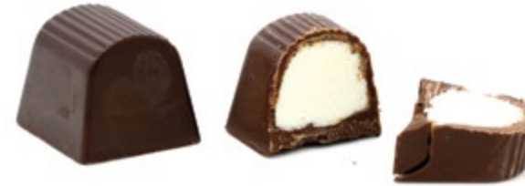
LE CHOCOLAT DES ÎLES Coconut filled milk chocolate