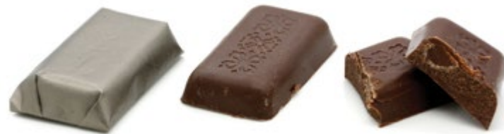
LA ROSÉE Dark chocolate with rosé Water flavor