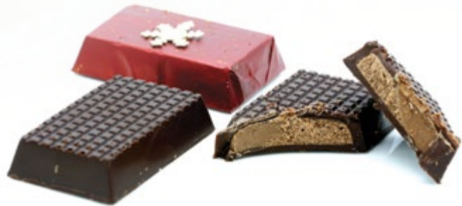
L'ORANGER Dark chocolate filled with orange chocolate