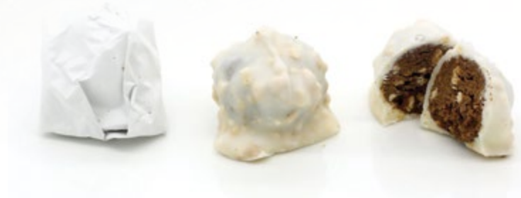
LE CROUSTILLANT DES NEIGES Crispy ganache coated by white chocolate